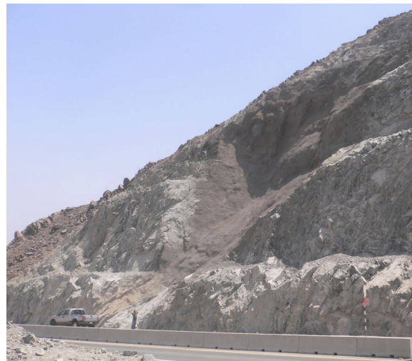
Dry sprayed concrete with MEYCO ® FIB SP540 used for slope stabilisation

The fibres are packed loose in 6kg transparent plastic bags or in cardboard boxes to suit dosing into the mixer. Alternative pack sizes are available upon request and should be specified when ordering.